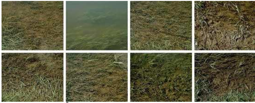
ÜBERSCHWEMMUNG, 2008, 8 PHOTOS, ALL: 82x206CM