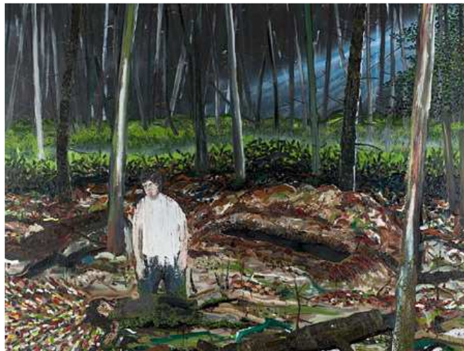
CAN I FORGET WHAT I CAN NOT FORGET AND LIVE A LIFE, 2009-10, OIL ON CV, 190x250CM