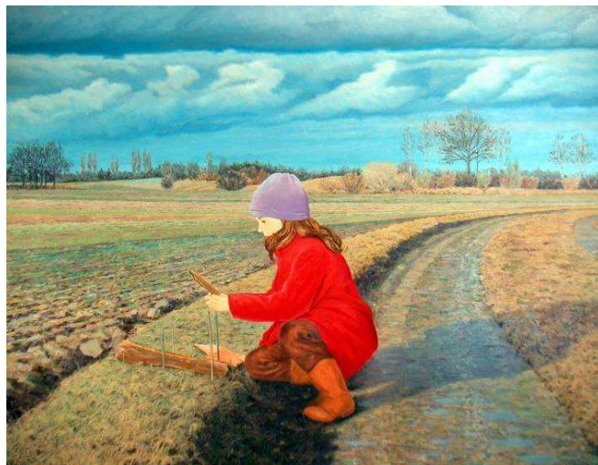
VORFRÜHLING, 2010, OIL ON CV, 100x130CM