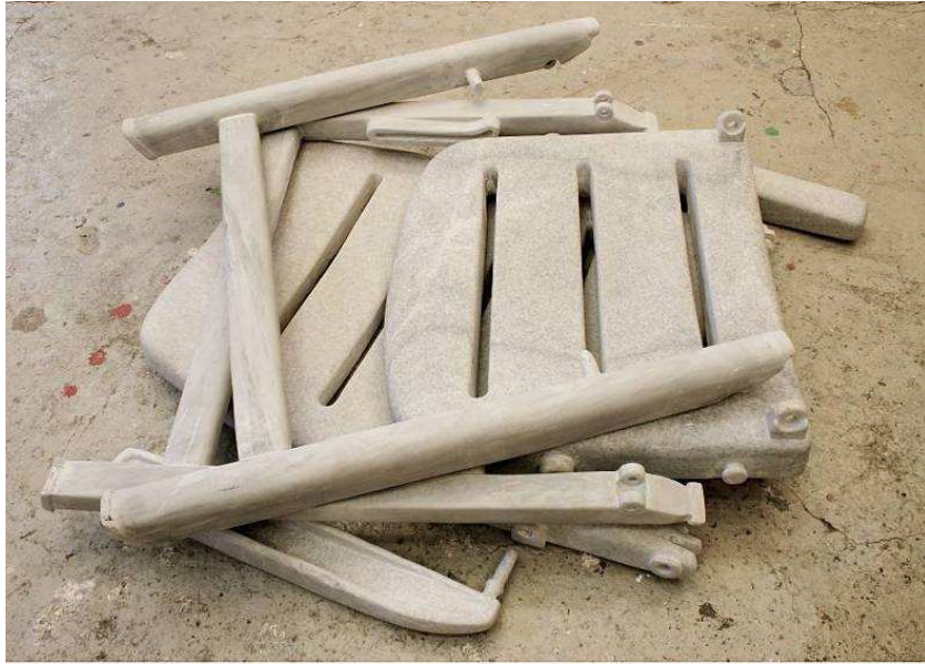
MARKUS WÜSTE, Klappstuhl / Folding Chair, 2008, hellgrauer Marmor / light grey marble, ca 80x65x20 cm, ca. 60000g