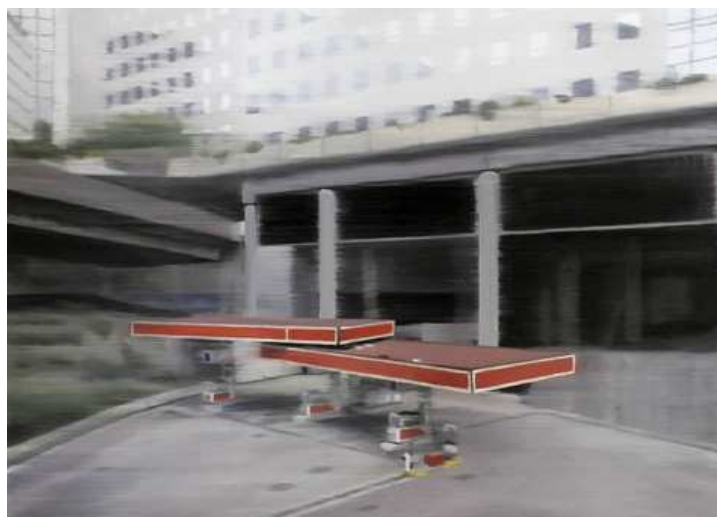
FUEL STATION IN CITY, 2009, OIL ON WOOD, 122x169CM