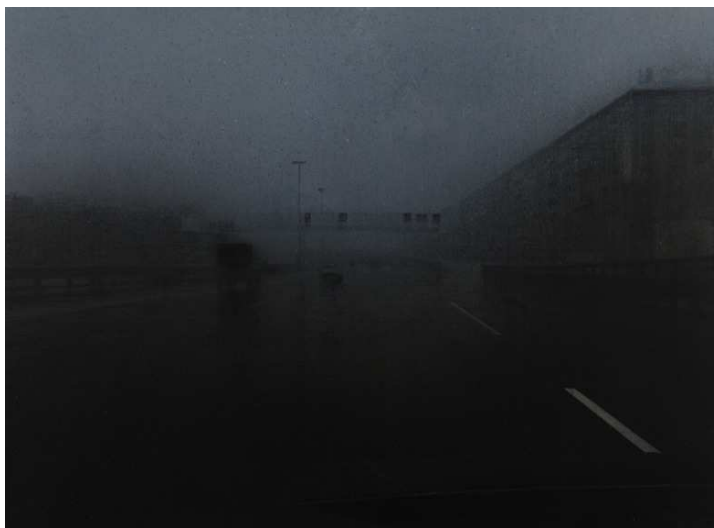
FROM SERIES MOSCOW MOOD, 2006, GRAPHITE ON PLASTIC, 120X150CM