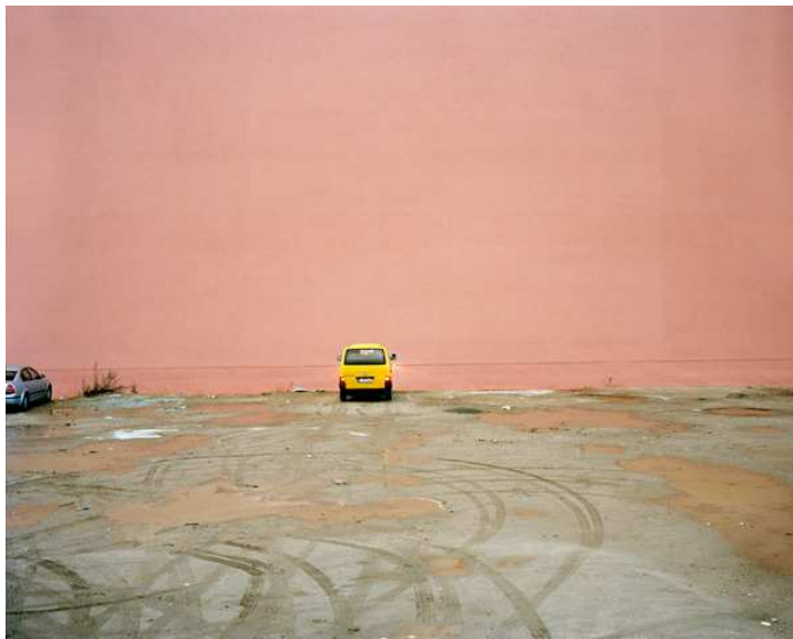
FROM SERIES TRANSITION BERLIN, 2008, PHOTO