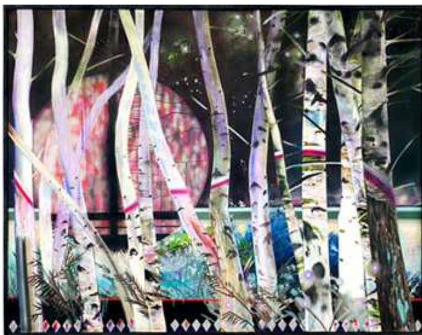
PIONEER SPECIES, 2008-9, MIXED MEDIE ON CV, 200x250CM