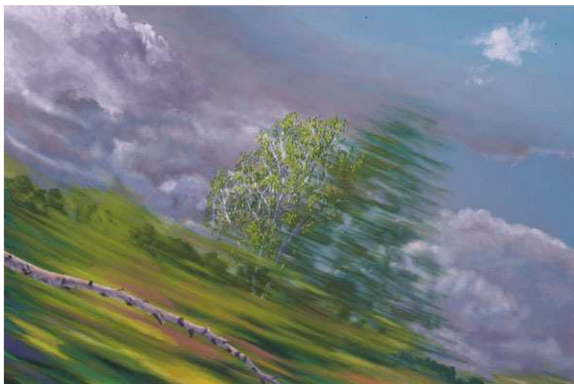
UNTITLED 2008, OIL ON CV, 30x45CM