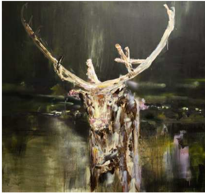
A2, 2010, MIXED MEDIA ON CV, 170x190CM