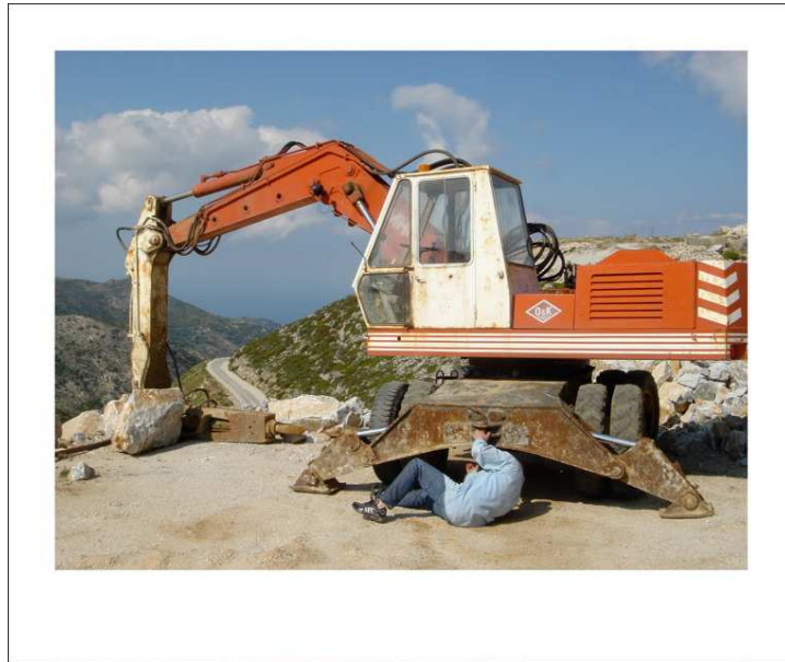
FROM SERIES MAIN D'OEUVRE, 2010, PHOTO