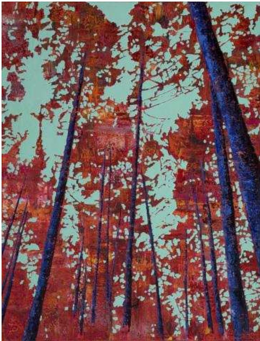
FAR FROM THE CITY V., 2008, OIL, ENAMEL PAINT ON CANVAS, 130x100CM