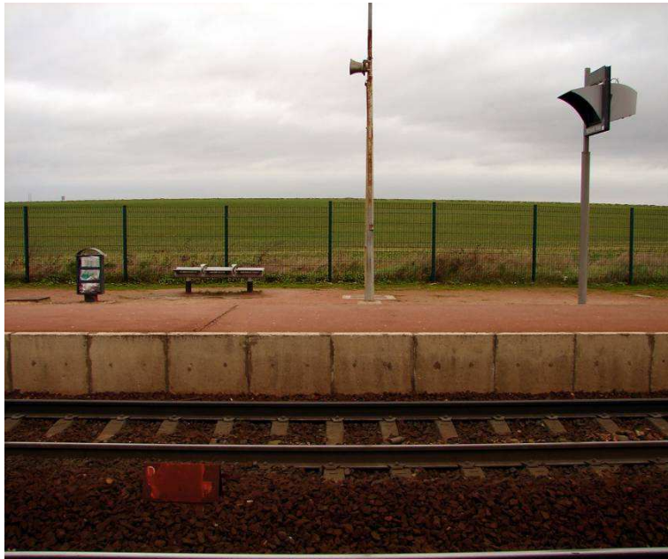
KEIN ORT, 2010 PHOTO INSTALLATION