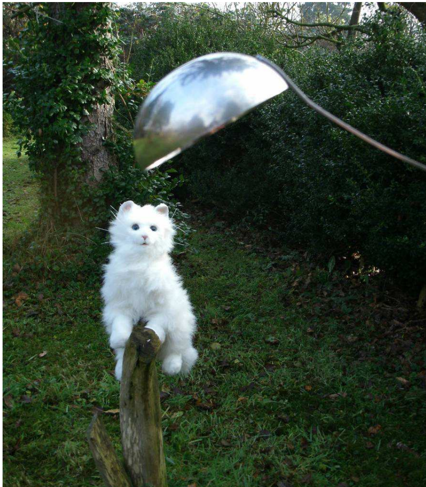
GOD TRAP (DETAIL), INSTALLATION, 2010