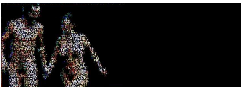
START VOTING, 2010, ACRYLICS ON CV, 100x280CM